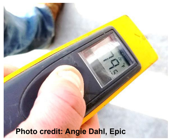
Hand-held temperature sensor

Test your hand-held sensors by aiming at a glass of ice water- it should read 32°F