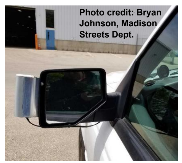
Mirror-mounted temperature sensor